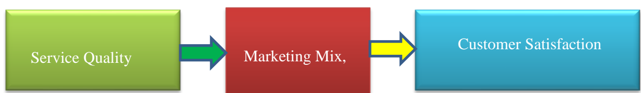
Image: Research framework, 2020

This type of research is a type of quantitative descriptive research. This study used a questionnaire with a numerical scale and an ordinal scale with a Likert scale 1-5. The sample consists of many members selected from the population, namely 1000 (one thousand) people, wherein this research, 100 (one hundred) bank customers will be sampled as samples. This research uses the Slovin formula so that the sample range that can be taken from the Solvin technique is between 10% of the study population. The purpose of this research is to examine data to convey and limit findings to become organized, structured, and meaningful data. The data carried out is a quantitative analysis expressed by numbers and the calculation uses descriptive methods and Partial Least Square (PLS) which is assisted by using the Smart-PLS version 3.0 application program.