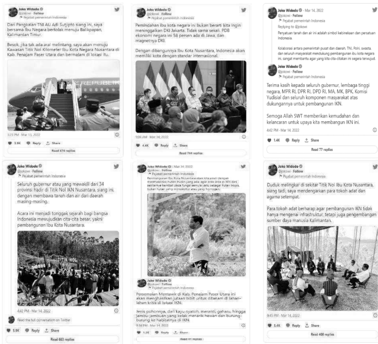
Figure 9. Discourse on the Unification of Land and Water at the Kilometer Zero Point of the Capital City