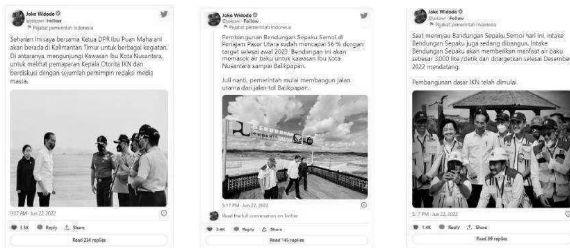
Figure 10. Discourse on the Basic Development Visit of the Capital City of Nusantara

Joko Widodo used the Javaism strategy to declare that the Capital City of Nusantara is supported and will be realized.