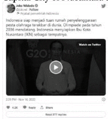
Figure 12. Discourse on the Capital City of Nusantara as host for the 2036 Olympics