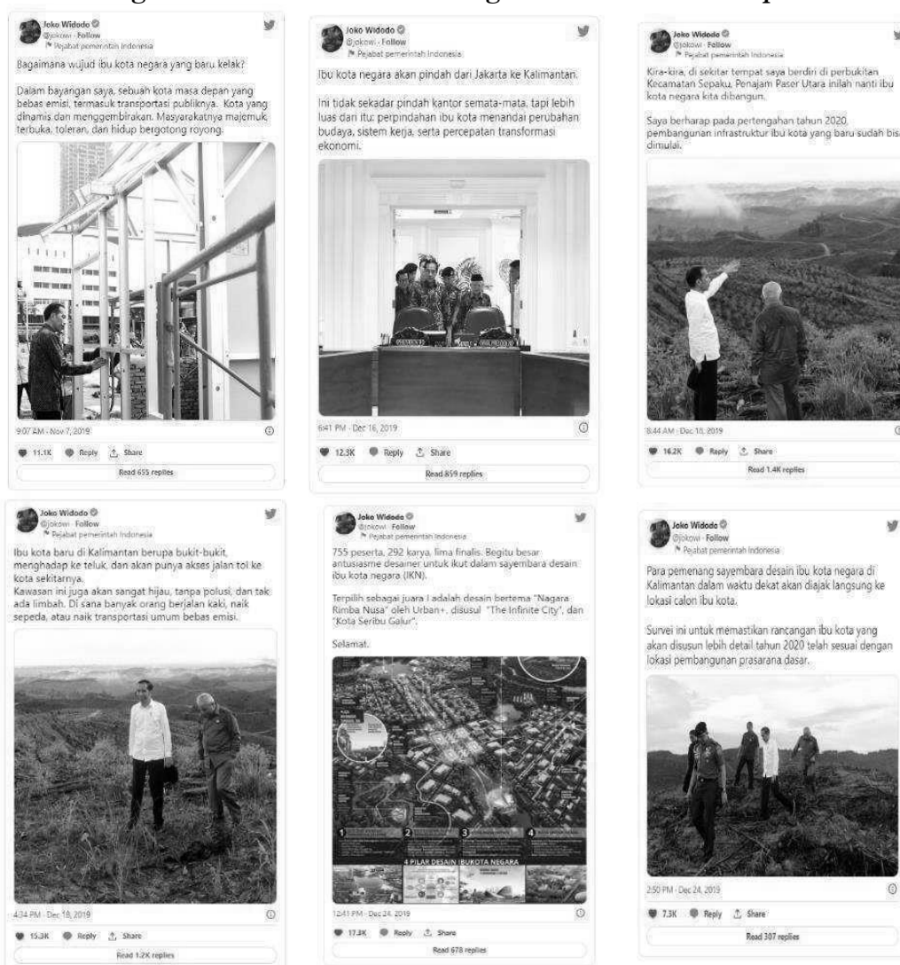
Figure 5. Discourse on the Design of the New State Capital

On the one hand, the mention of "not the fault of the DKI Jakarta Provincial Government" is indeed not the fault of the government's engineering in the design of the city's spatial system. This was because since the area of Jakarta was still called Jayakarta (Batavia), means of transportation were not focused along with the insignificant population volume at that time. But on the other hand, there is a public perception of the relationship between President Joko Widodo and Jakarta Governor Anies Baswedan. The relocation of the national capital has nothing to do with the relationship between the two politicians, so President Joko Widodo called it "not the fault of the DKI Jakarta Provincial Government". In addition, efforts to get out of the Java-centric development mindset have also been a strong motive in President Joko Widodo's actions, even since his first term in office.