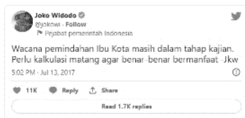
Figure 1. The beginning of the discourse

The discussion on the New State Capital started with President Joko Widodo's tweet on July 13, 2017: