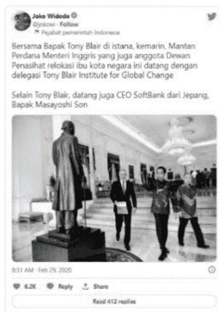
Figure 6. Pre-Pandemic Discourse and New State Capital Steering Committee

The Minister of PPN/Head of Bappenas Suharso Monoarfa explained that the design copyright belongs to the state, the design will spark an idea thematically, and because it is a competition, technically it cannot be used directly in development. However, the winner of the design competition not only gets a prize of 2 billion rupiah, but also can openly take part in the construction of the National Capital (Siregar, 2019). The statement from the government has also been proven, when the published design of the state palace will use the design of I Nyoman Nuarta, who is the designer of Garuda Wisnu Kencana Bali. Later this design received criticism from the Association of Indonesian Architects, even though the design had been approved by President Joko Widodo (CNN, 2022).