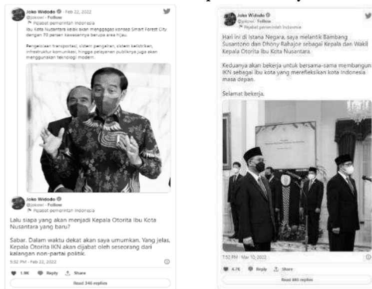
Figure 8. Discourse on the Mention of Nusantara and the Appointment of the Head of the New State Capital Authority