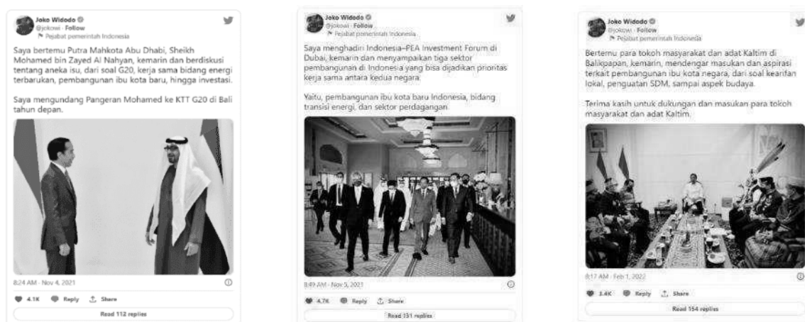
Figure 7. Discourse on the New State Capital after the Pandemic Year

The development of the National Capital City during the Covid-19 pandemic situation was criticized by several parties, one of which, for example, was Member of the Republic of Indonesia DPR Fadli Zon who said that the Government should have prioritized policies on handling the pandemic and recovering the people's economy. In addition, relocating the National Capital does not have the nature of urgency due to an abnormal situation due to budgetary difficulties, accumulated debts and so on ( DPR, 2021 ).