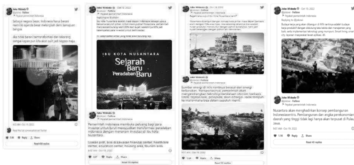
Figure 11. Discussion on Exploring the Capital City of Nusantara Market