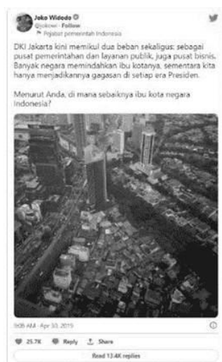
Figure 2. Discourse after the Political Year

After the tweet on July 13, 2017, there were no subsequent tweets that specifically discussed the Capital City until April 30, 2019. In the 2017-2019 period, the national agenda that was in the spotlight was the 2019 General Election. There was no serious discussion about relocating the capital during the campaign period, even from President Joko Widodo as the incumbent candidate. However, Bappenas is still reviewing the plan to move the capital city and the decision will be made by President Joko Widodo at the right time (Nasution, 2018).