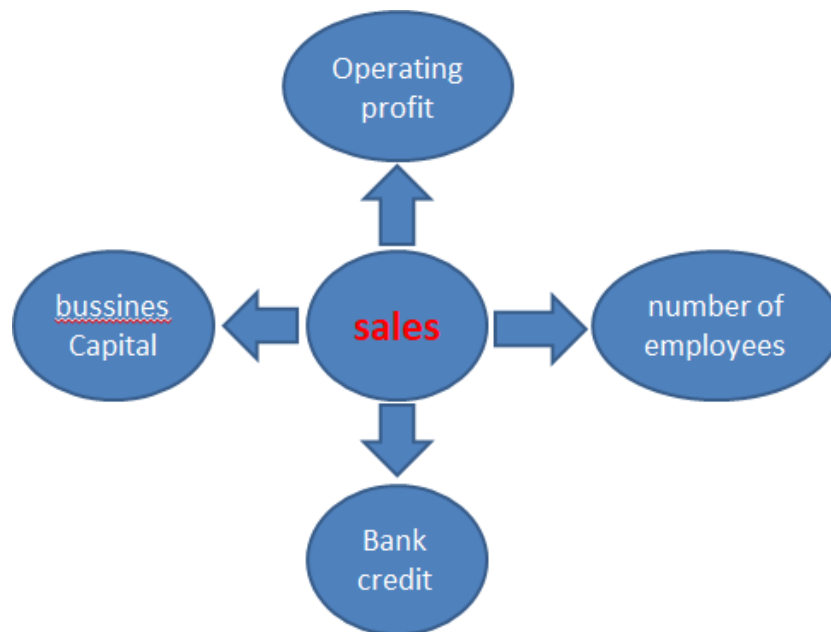
Figure 1. Impact of Covid on MSME Productivity

Second, a decrease in profit. Profit is the increase in an investor's wealth as a result of investing capital after deducting the costs associated with the investment. Profit can also be interpreted as the difference between the selling price and the cost of production. Profit or net income is operating profit minus taxes, interest costs, research and development costs. Net income is presented in the income statement by juxtaposing revenues with expenses. Profit can be divided into two, namely a pure economic understanding and an accounting understanding. Profit in economics can be interpreted as the profit earned by an investor in a business activity. This of course has been reduced by the operational costs that exist in a business that is run. This will make it easier to understand profit or what is generally known as profit. Meanwhile, profit according to accounting science is defined as the difference between the selling price and the costs incurred at the time of production.