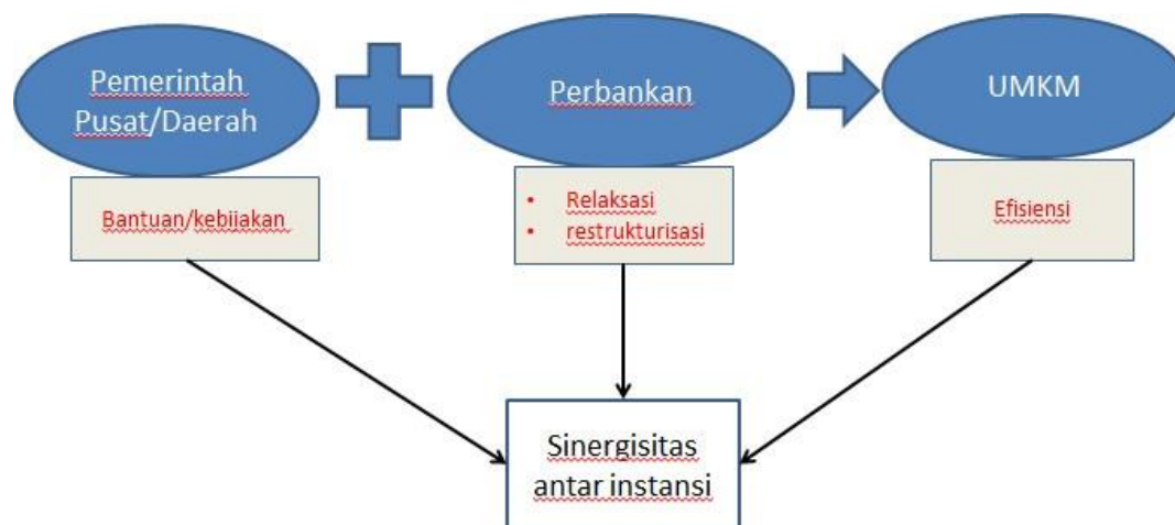
Figure 3. MSMEs Synergy

The results of the FGD and interviews conducted with MSME actors, it was found that the Samosir Regency Government has been responsive to the condition of MSMEs after Covid 19. The banking sector has also issued policies to help MSMEs, as well as MSME actors themselves have made efforts to remain productive after Covid-19. The efforts that have been made by the Samosir Regency Government through the Social Service, Trade, Industry, Cooperatives and SMEs Offices as well as other district government agencies, Banking and MSME actors can be described as follows: