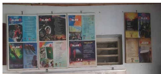
Figure 2. Palawa Magazine Archive