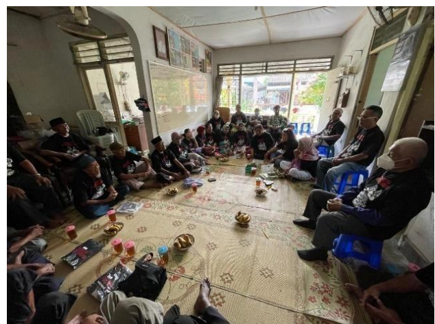
Figure 1. Regular Consolidation of SekBer'65

The involvement of the children and grandchildren of victims not only strengthens the sustainability of the