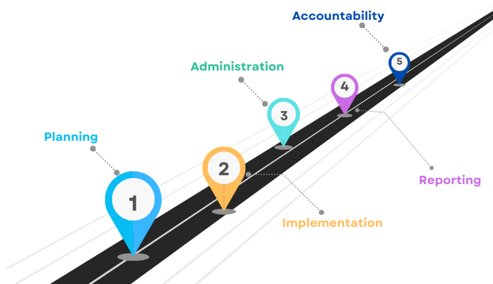
Figure 2 Village Fund Management Process

Planning determines what must be done to achieve certain goals, especially where, by whom, or how to achieve those goals. Thus, planning in managing village funds is the activity of selecting a series of activities related to development in the village and then focusing on what must be done, when, how, and by whom (Watts et al., 2019). This planning process produces documents in the form of Village Fund planning, including the Village Medium Term Development Plan and Village Government Work Plan, which are prepared as a result of agreements in Village deliberations. At the planning stage, communication is an important aspect that must exist in the form of deliberation. This communication was carried out in a participatory manner in a village development planning deliberation forum involving the Village Consultative Body and elements of the village community in Nagan Raya Regency.