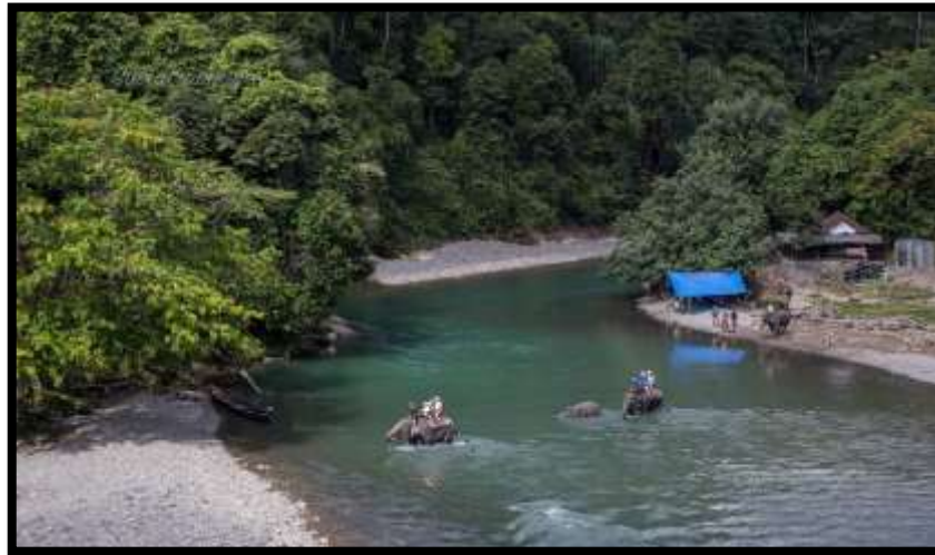
Figure 1: Exotic natural scenery of Tangkahan

Elmawati Falabiba, 2019 ). In addition to receiving away from the busyness and fatigue of city life, it also increases knowledge about nature and forests.