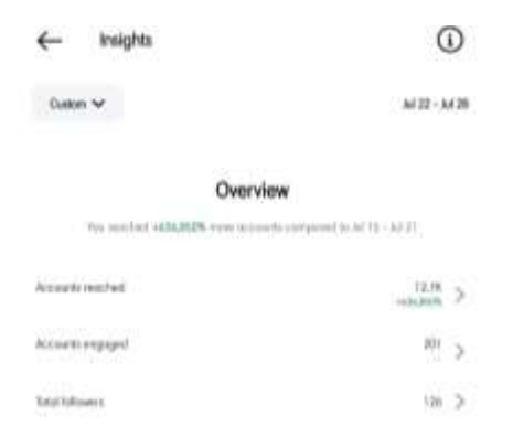
Figure 3. Insight Overview

The evaluation revealed significant achievements in the campaign. The Instagram account saw a substantial increase in followers and engagement, indicating a positive response from the target audience. Account reach and ad insights exceeded the initial targets, demonstrating the effectiveness of the promotional materials and strategies used. Content interactions and follower growth also surpassed expectations, highlighting the campaign's success in generating interest and engagement. These results provide a strong foundation for future promotional activities and underscore the importance of well-defined KPIs in guiding and assessing the success of marketing strategies.