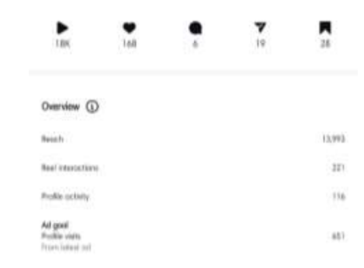
Figure 4. Insight Ads