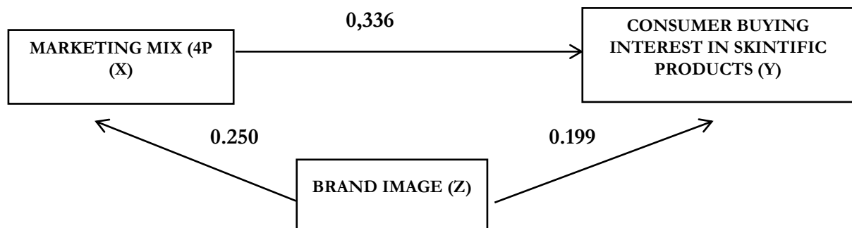
Figure 2. Indirect Relationship X Affects Y Through Z

From the coefficient table in Model II testing, it can be seen that the significance values for both factors, specifically X = 0.014 and Y = 0.049, are lower than the 0.05 significance threshold. This finding indicates that Model II successfully addresses the relevant factors in the analysis, with approximately 86.2% of the variance explained by other factors not included in the initial exploration. The value of e1, which is the square root of 1 minus the coefficient of determination (R-squared), was obtained as \sqrt{1-0.138} = 0.9284 . This result emphasizes the importance of both factors in the Model II framework, which is included in Figure 2.